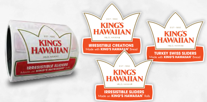
"MADE with KING'S HAWAIIAN®" Stickers